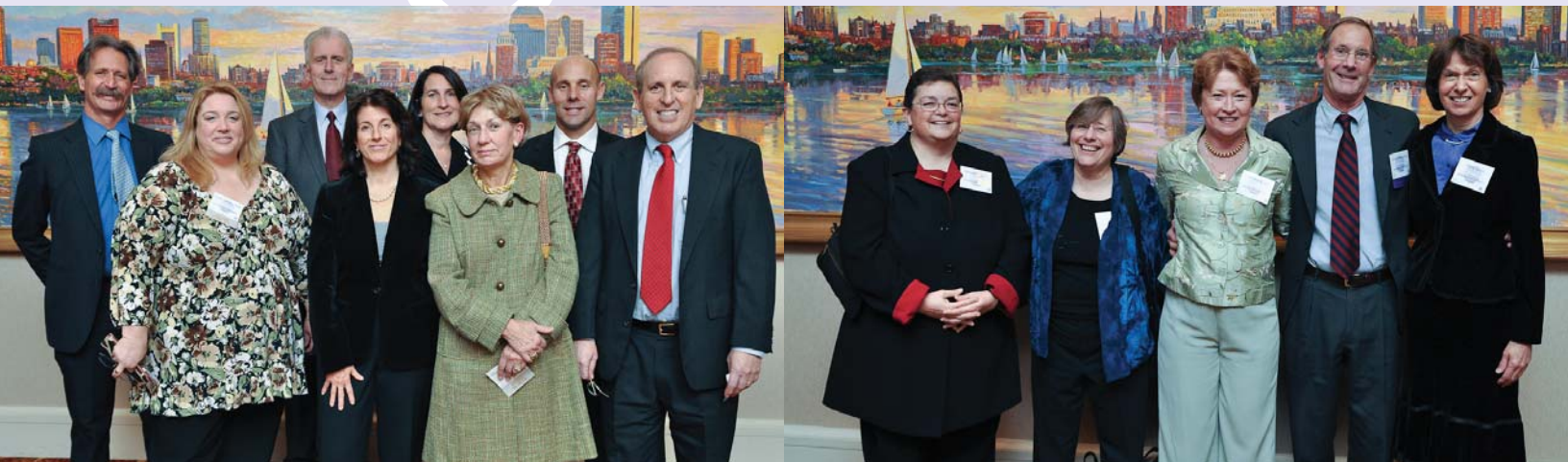
MITSS Board of Directors