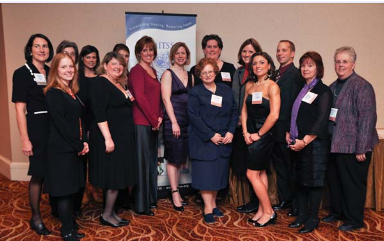
MITSS Planning Committee

“The Massachusetts Nurses Association congratulates the MITSS Annual Dinner Planning Committee on its planning and implementing of the MITSS Annual Dinner at the Marriott Copley on November 12, 2009. The timely crafting of the event from the pre-dinner functions, the actual dinner, outstanding speakers, and timely conclusion should serve as a model for all organizations. It is an honor to be associated with MITSS.”