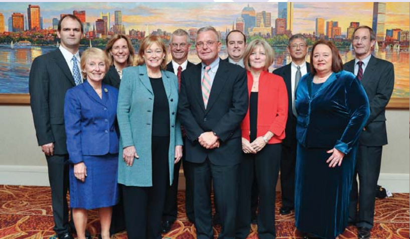
MITSS Annual Dinner Leadership Committee